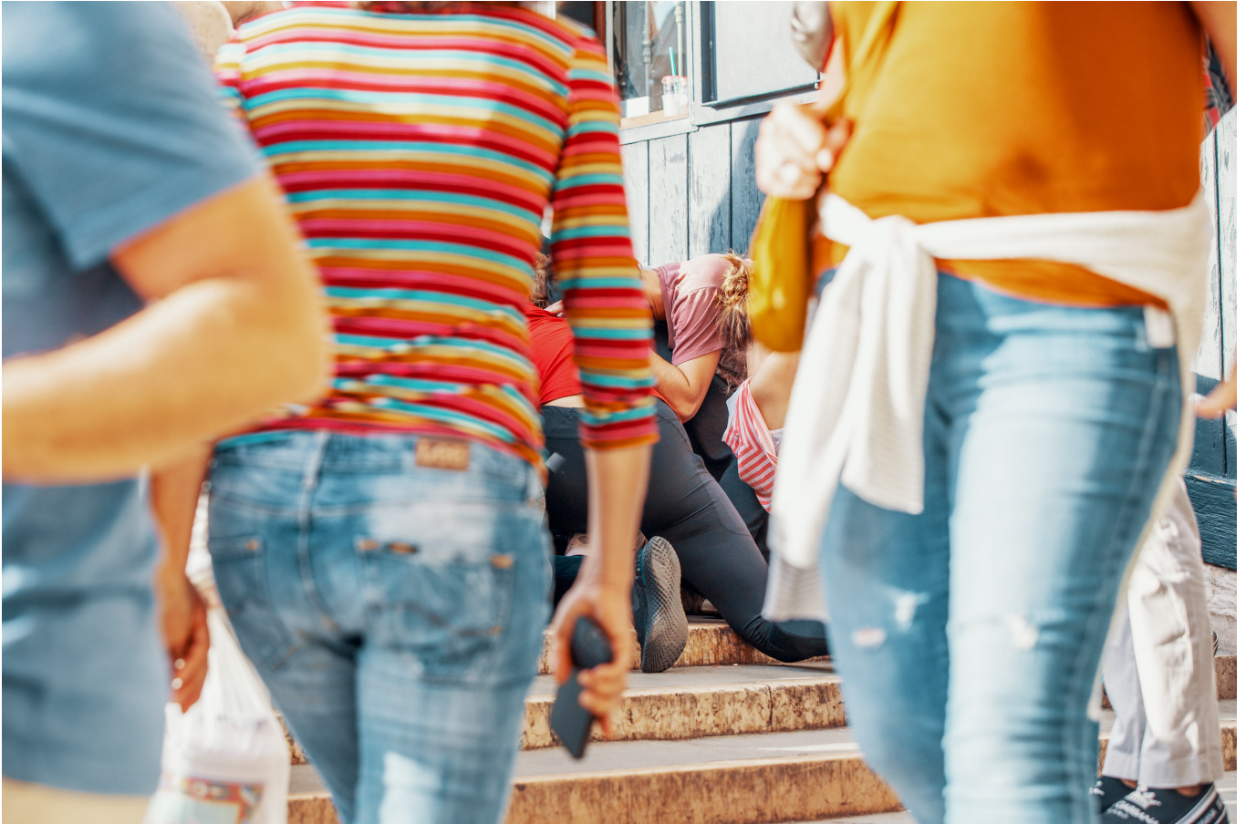
TBA21–Academy, The Current II , Summer School #2: Phenomenal Ocean led by Chus Martínez.